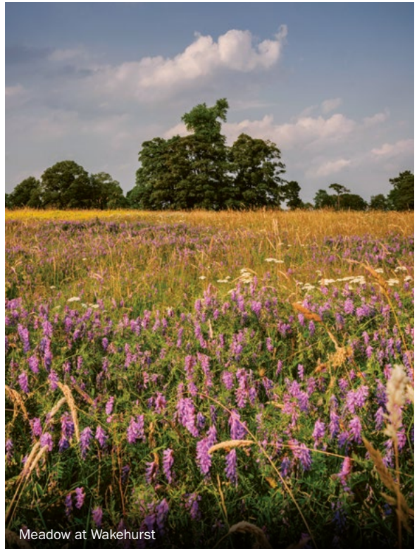
Meadow at Wakehurst

As a charity, we rely on this critical support, not only to sustain the gardens but also to protect global plant and fungal biodiversity for the benefit of our planet and humanity.